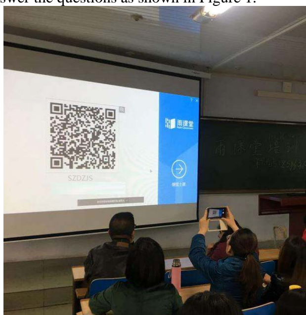
Fig.1. Students use mobile phone scanner to log in to Rain Classroom to answer questions

Rain Classroom is developed by the school online and online education office, aiming at connecting the intelligent terminals of teachers and students. Every link of pre-class and post-class will be endowed with a brand-new experience to maximize the energy of teaching and learning, and promote teaching reform. The existence of time-limited exercises in class improves students' attention. "Understanding" buttons, bullet curtain, pre-class preview and other links help to improve students' awareness of active participation, and pre-class, after-class pushed PT and other information can enable students to learn at any time. For the teacher, all the student's learning behavior data is automatically and completely collected, which helps to quantify the student's learning effect and grasp the student's learning trajectory. "Teaching content teaching based on the pre-study data, using the Rain Classroom to push targeted questions in the teaching process, students can immediately know the answer results, teachers can answer questions in the first time. To determine which problems are error-prone, According to the answer to the question, the corresponding explanation will be given. The student uses the mobile phone scan code to log in to the Rain Classroom to answer the questions as shown in Figure 1.